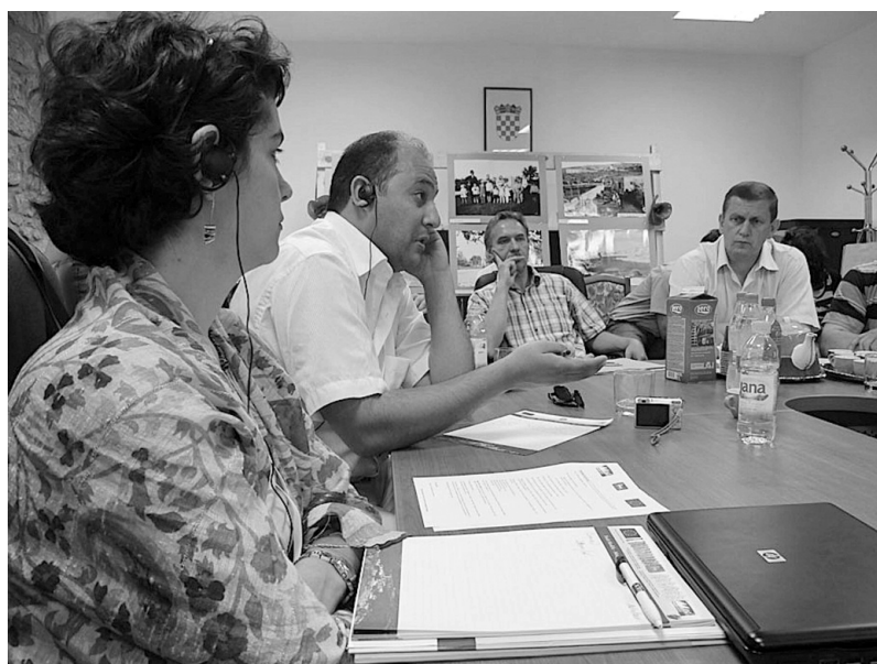
Picture 3: Activities of partnership elaboration: regulation of property rights of the Community forests in the Mountain area of Cicarija.

ers, drafting of several documents and translation of the tool kit for the creation of the model forest which were essential activities in rising knowledge and awareness of the model forest concept and about the definition of strategic objectives. The organised activities had a very important aim of identifying good potential representatives of the territory which would be able to create a future functioning of the model forest according to all good governance principles required. The biggest challenge was how to attract motivated and enthusiastic stakeholders representing various sectors which needed to be involved in the fundamental committee, from the public, private and civil sector.