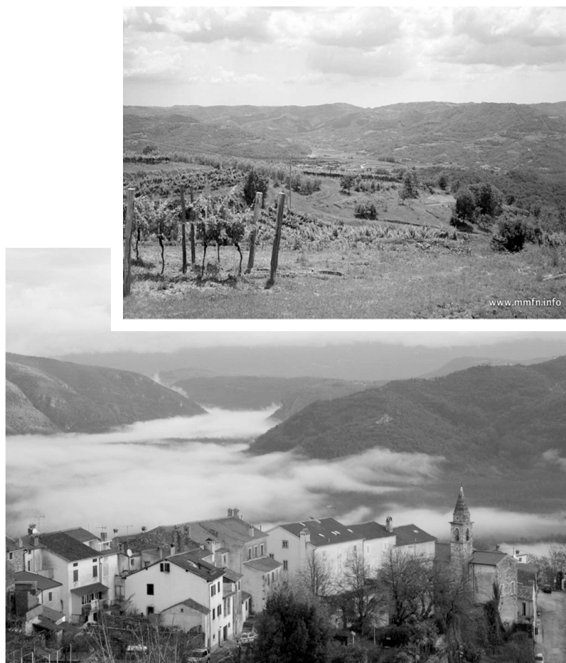
Pictures 1 & 2: The "Mirna River basin" Model Forest in the Region of Istria (Croatia).