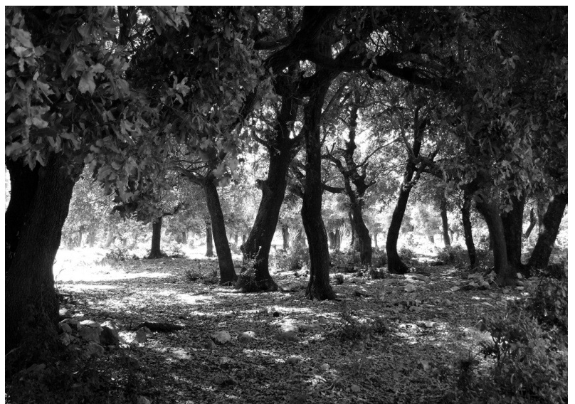
From top to bottom:

Picture 4: The land is worked in the traditional Mediterranean mode of terraced farming